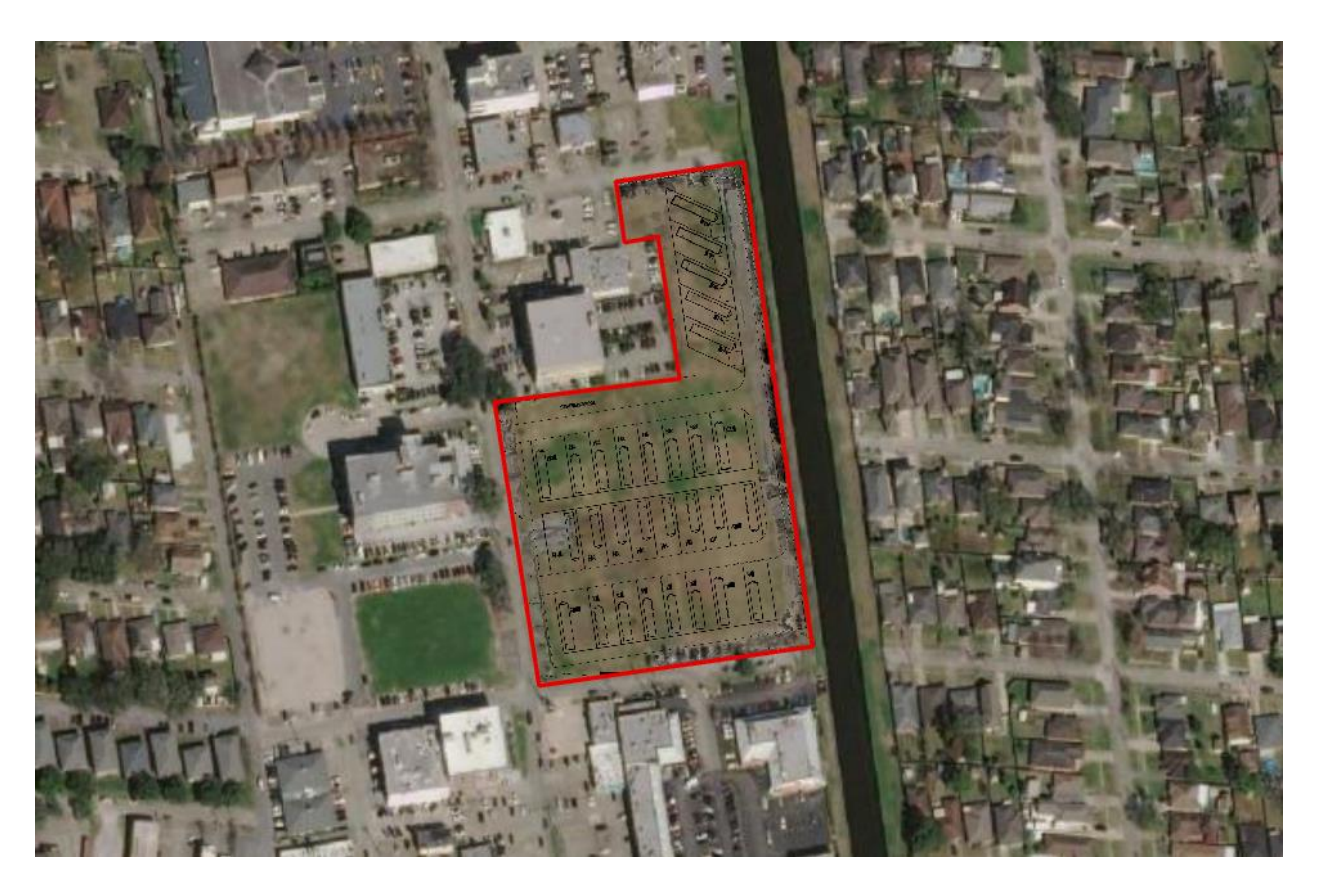
Figure 2: Metairie Group Site Proposed Layout