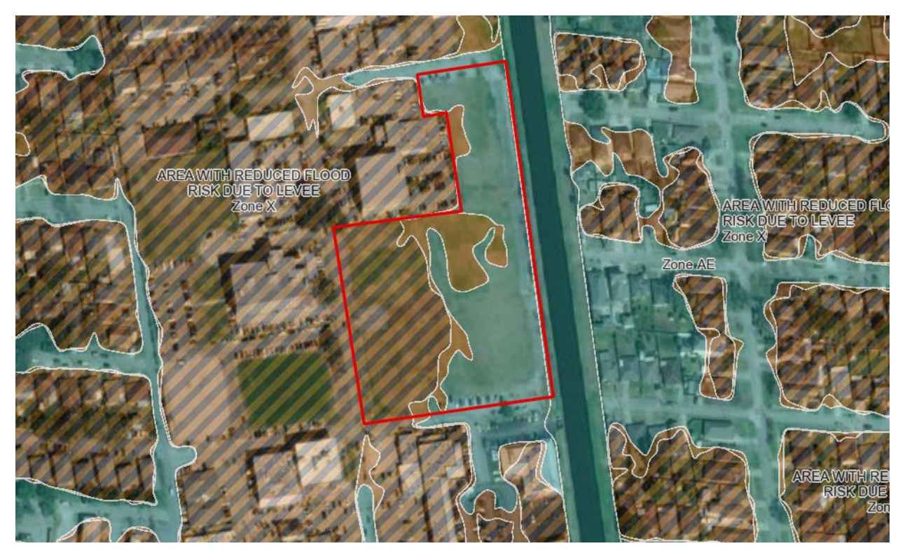
Figure 3: Proposed Metairie Group Site Flood Insurance Rate Map (FIRM)