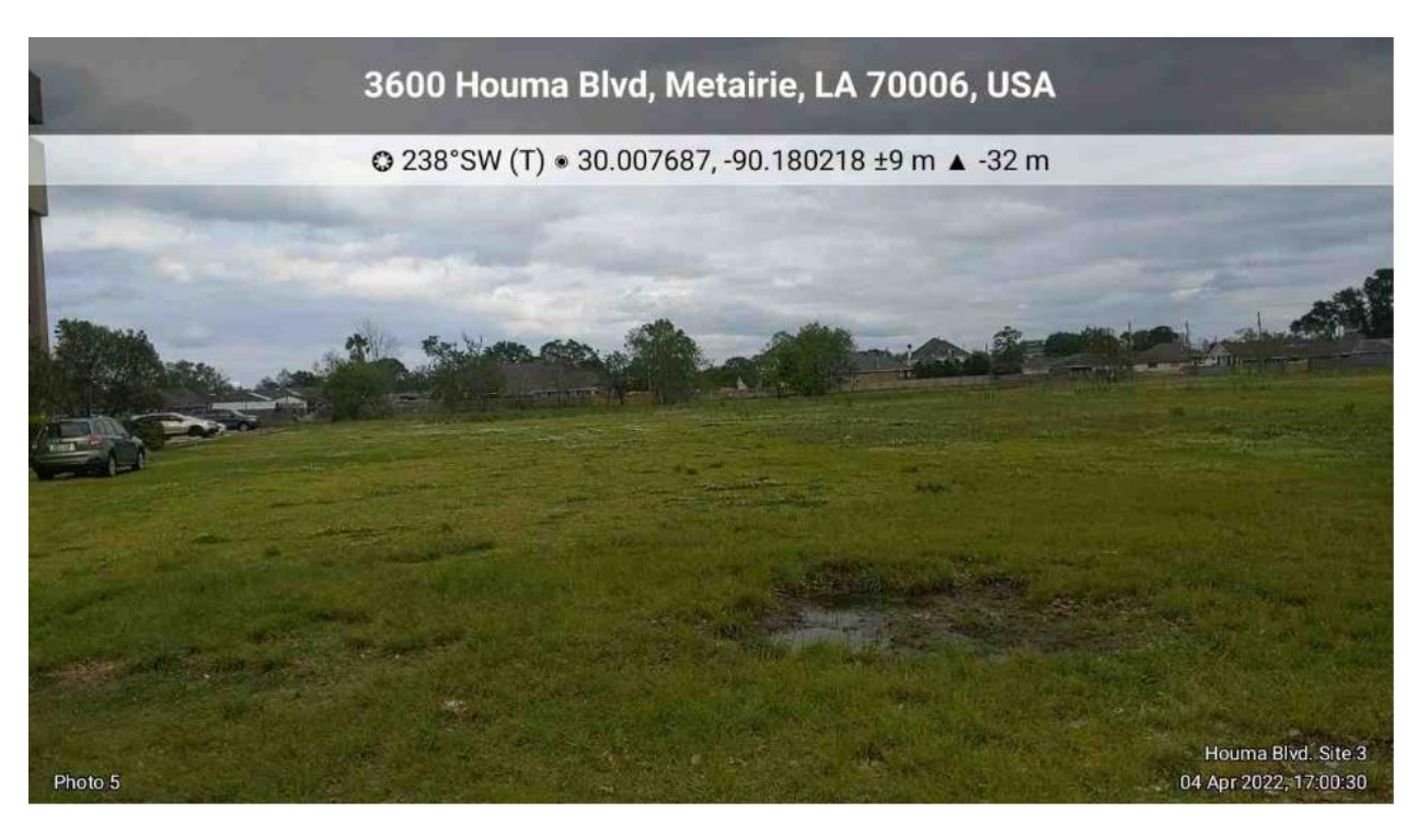
Figure 5: Photograph of Existing Site Conditions at the Proposed Metairie Group Site