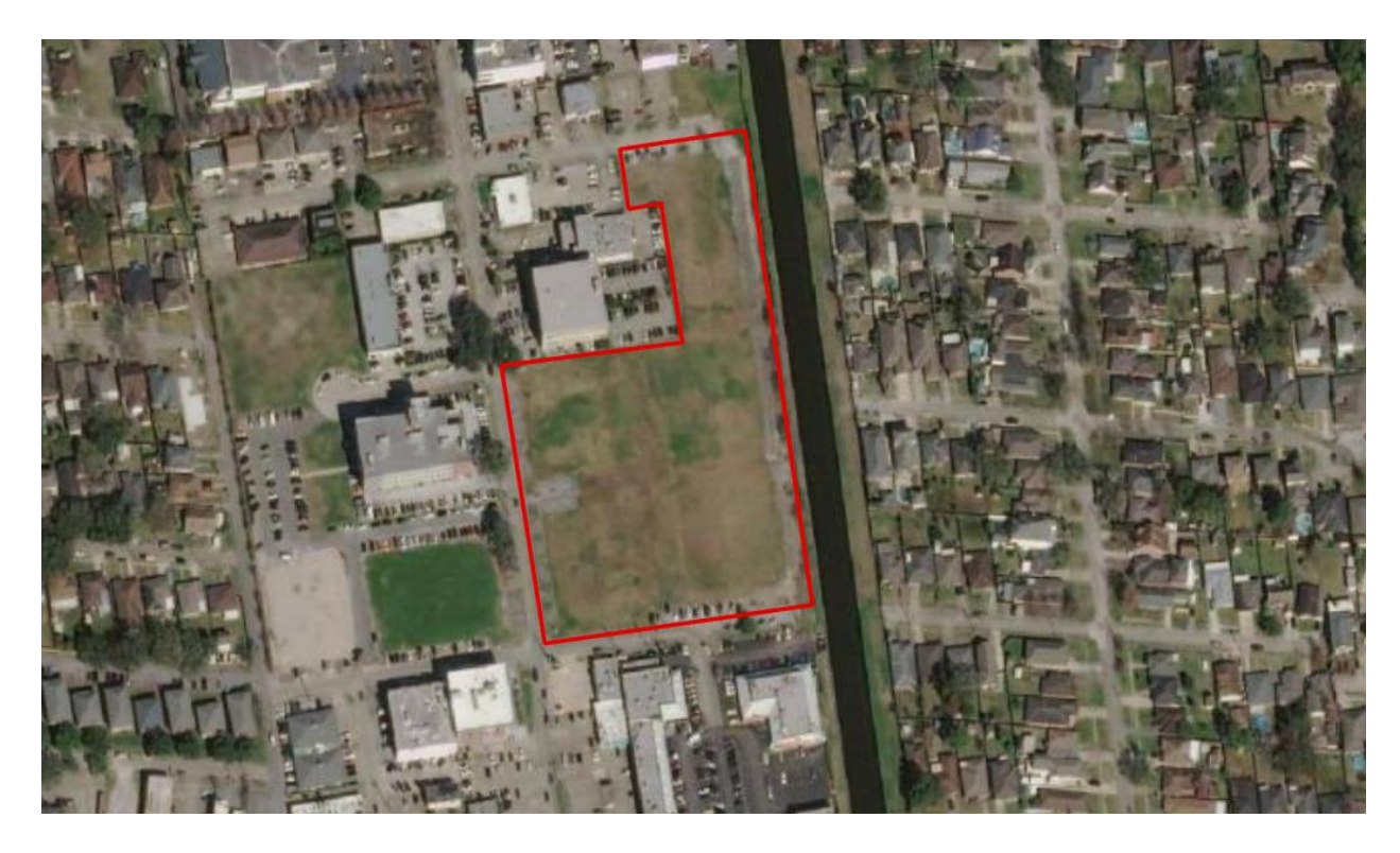
Figure 1: Aerial Photo and Vicinity Map of Proposed Metairie Group Site