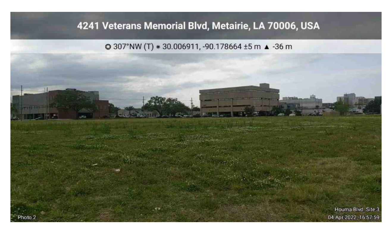
Figure 4: Photograph of Existing Site Conditions at the Proposed Metairie Group Site